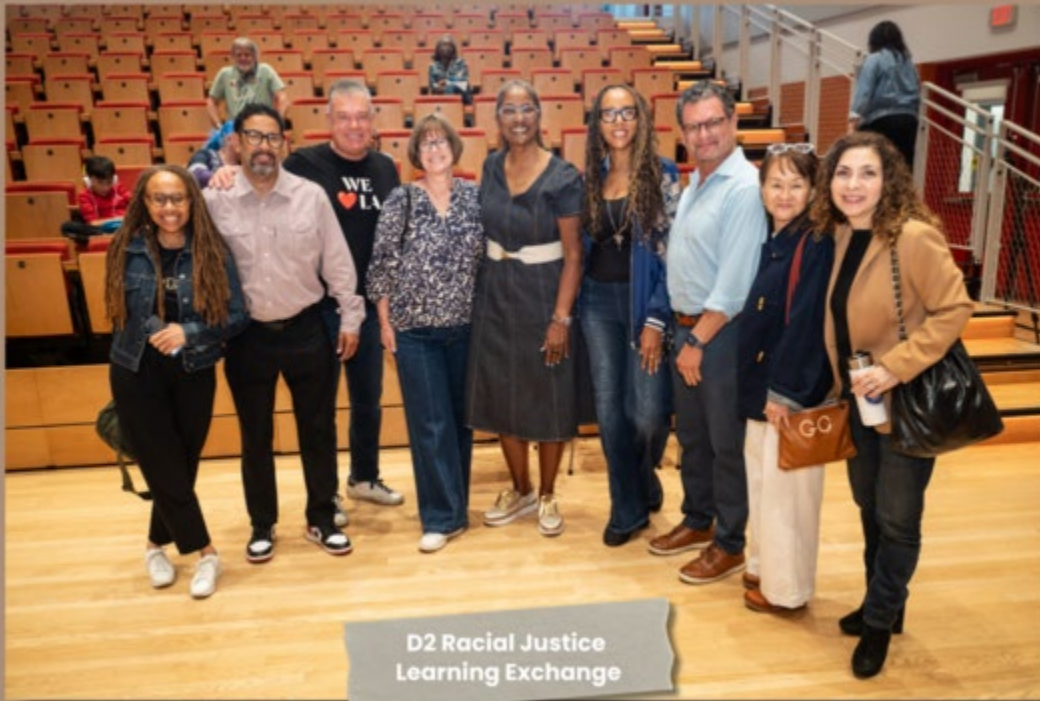
D2 Racial Justice Learning Exchange