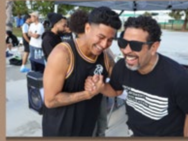
Community Impact Basketball Tournament