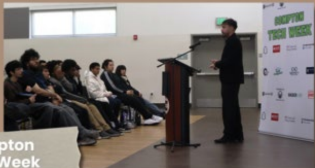
Compton Tech Week

Level Up Your Leadership Skills: Join a Heart of Youth Justice Reimagined Meeting