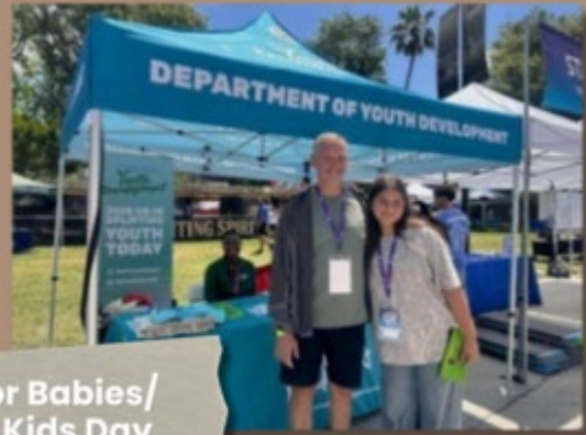
March for Babies/ Healthy Kids Day