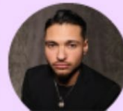
Joseph Roa Commissioner

molaa MUSEUM OF LATIN AMERICAN ART 628 Alamitos Ave, Long Beach, CA 90802