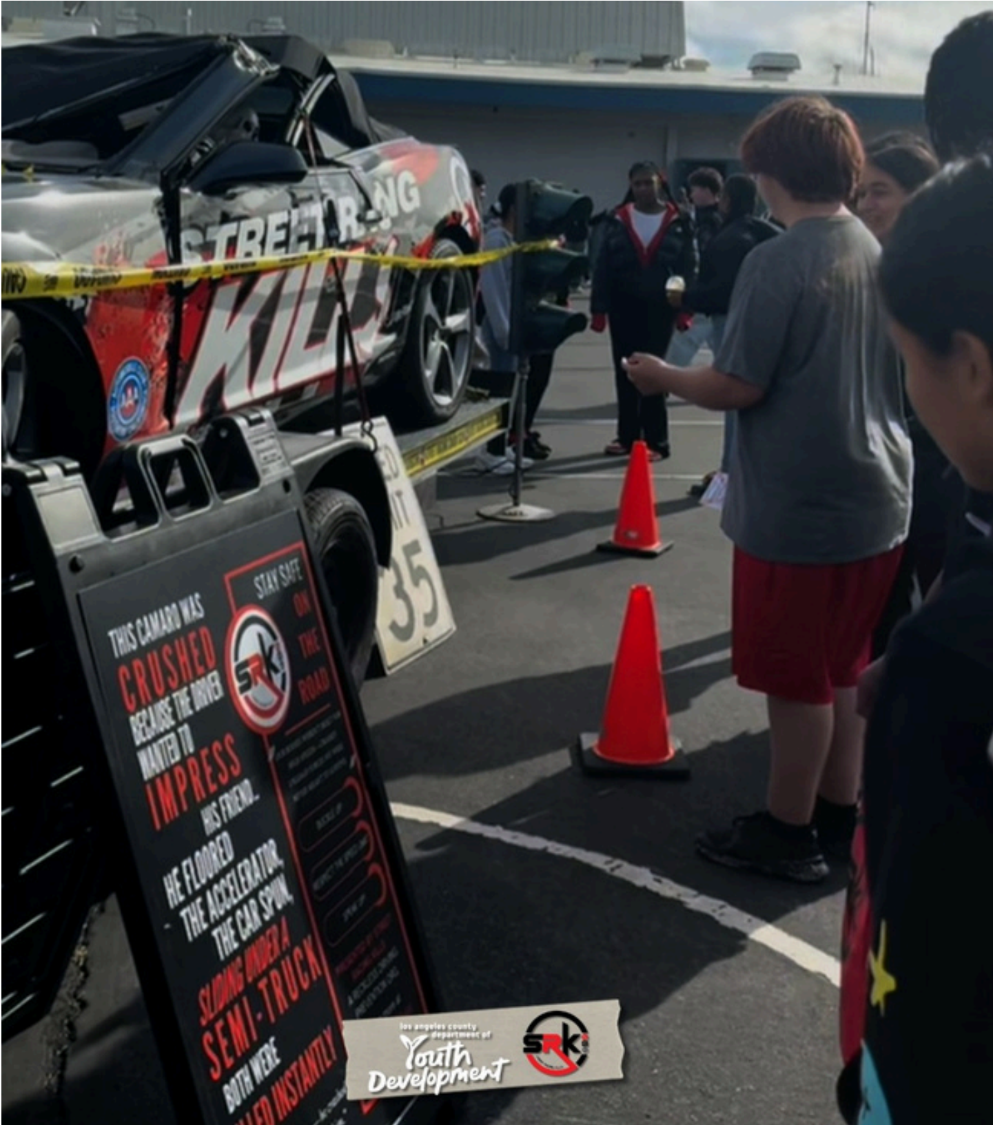
DYD partner Street Racing Kills (SRK) recently brought a powerful workshop to Piute Middle School in Lancaster, creating a space for students to confront the real-world consequences of reckless driving.