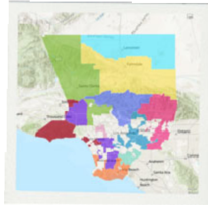
Map of current law enforcement diversion partner coverage.

As part of DYD's ongoing work to expand youth diversion countywide, the diversion team has successfully executed a Partnership Agreement with the Los Angeles Police Department, allowing DYD to become the sole youth diversion provider for all LAPD community stations. Additionally, DYD is working with nearly 20 additional law enforcement agencies, and 4 additional diversion partners as we seek to complete our Countywide Diversion Network.