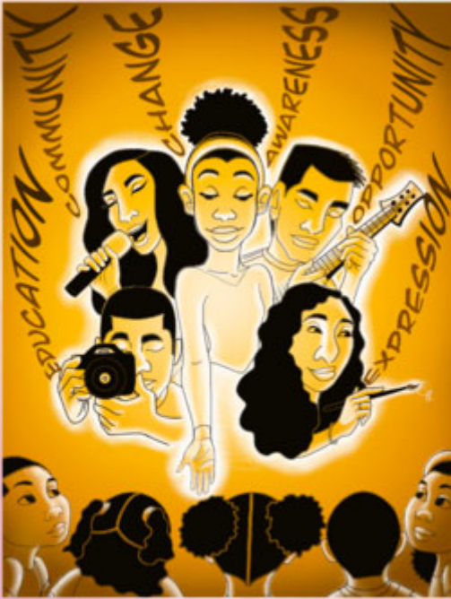
Art is Our Future By Tia Reed